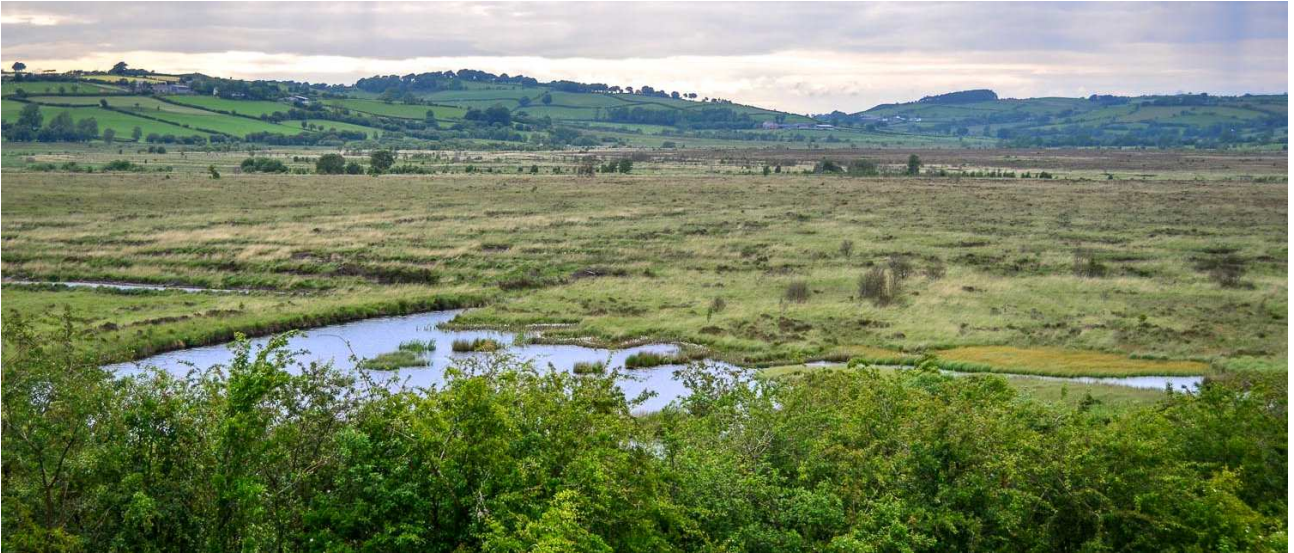
Cors Caron raised bog, a large, landscape-scale feature of the upper Teifi Valley.