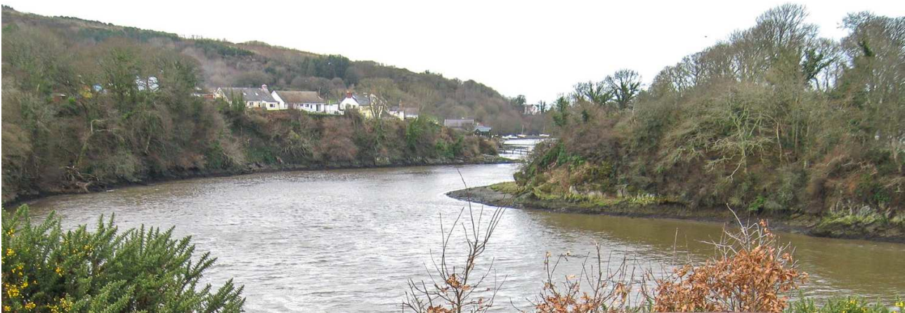
The incised and woodland-fringed upper estuary of the River Teifi above Cardigan