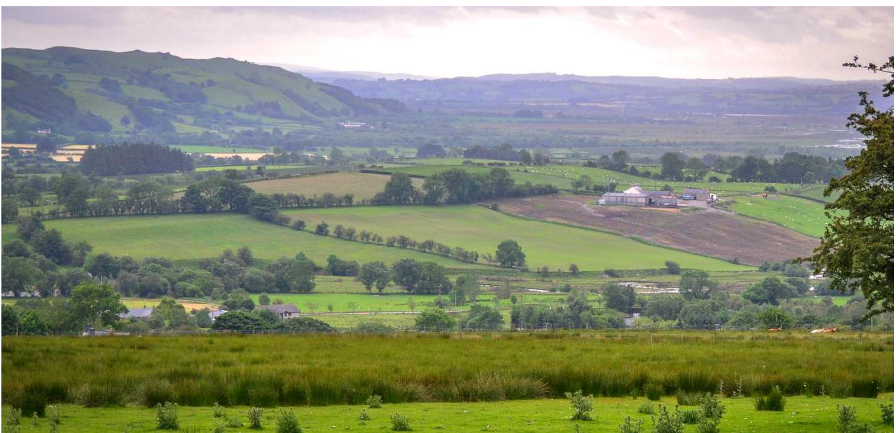
Looking south with rising Cambrian Mountains to the left and Cors Caron raised bog occupying the large flat area to the distant right.

The Teifi is one of the few names identifiable from Ptolemy's first-century Geography, where it is called the Tuerobis.