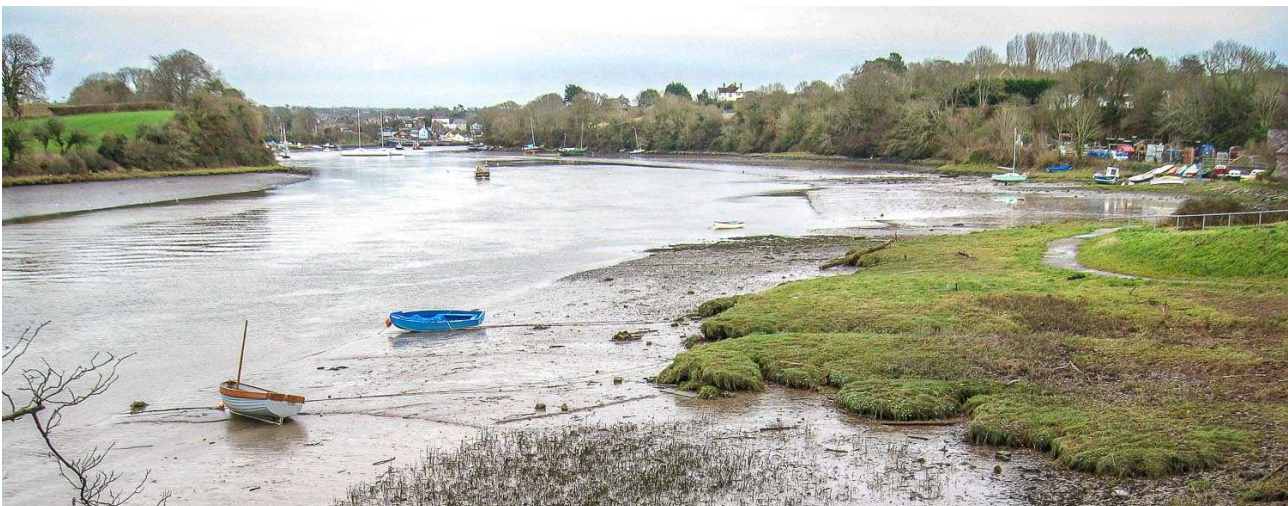
The widening estuary of the River Teifi at Cardigan