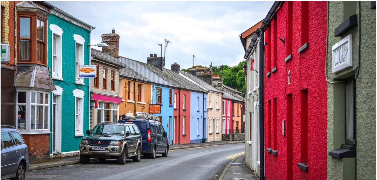
Another example of the colour wash approach, this one being at Tregaron