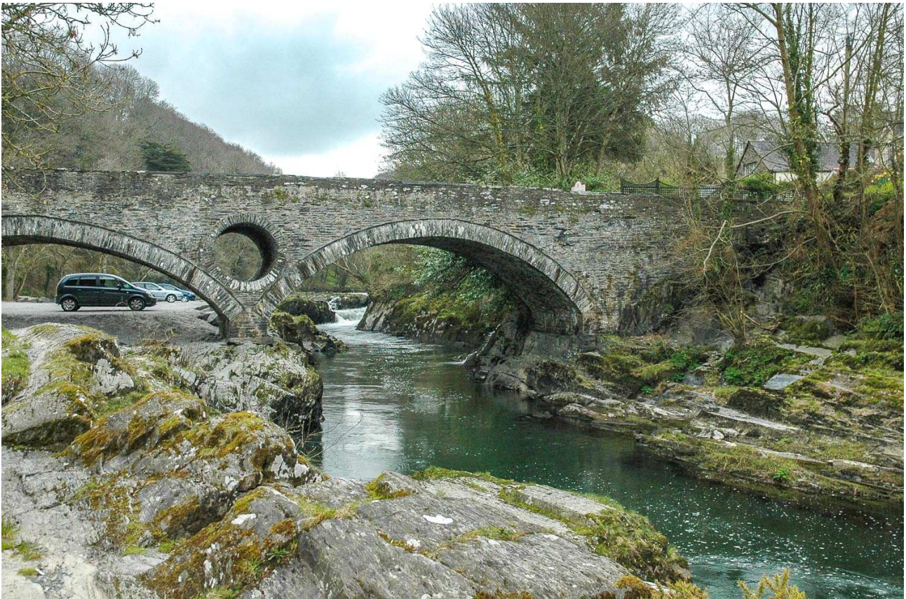
Teifi Bridge at Cenarth