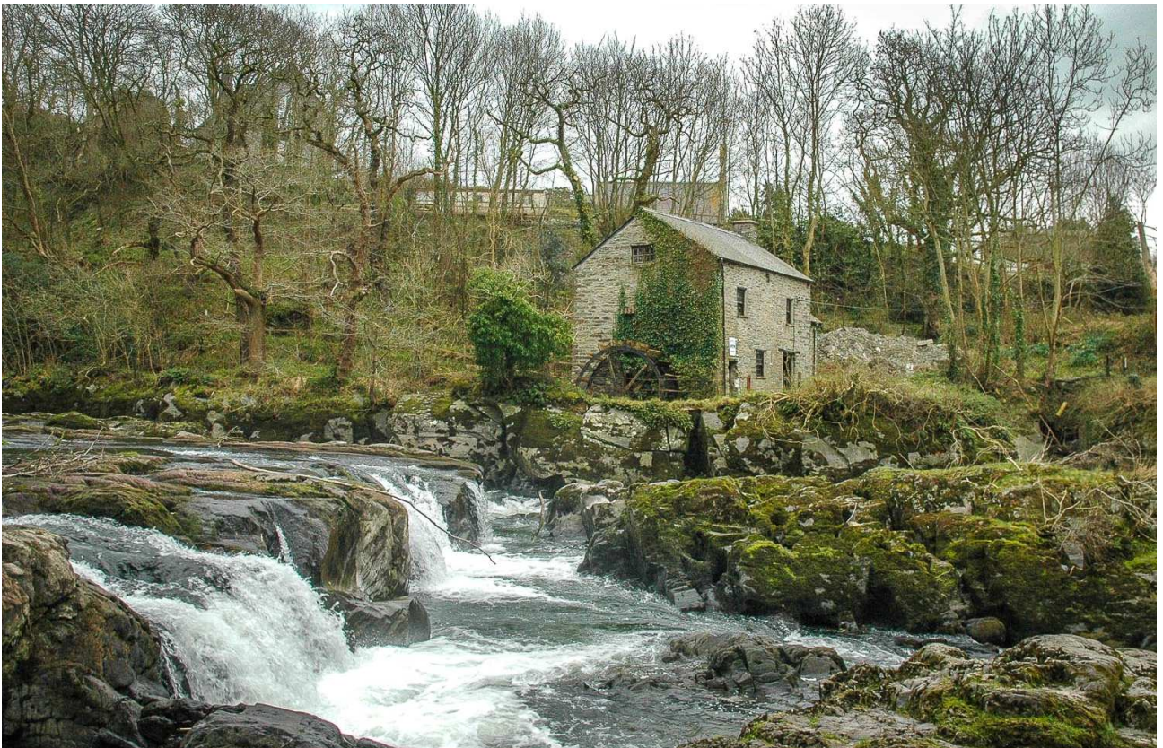
Cenarth Falls on the River Teifi near Newcastle Emlyn