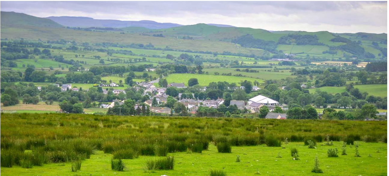
Pontrhydfendigaid (in the upper Teifi valley) showing the setting of the valley in relation to the adjacent Cambrian Mountains.