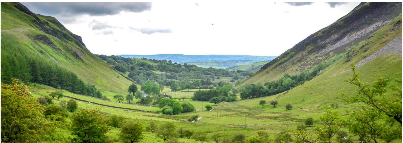
Looking out from the Cambrian Mountains, into the Teifi Valley, which crosses from right to left, and to a distant backdrop of higher ground, the Bro Ceredigion character area.