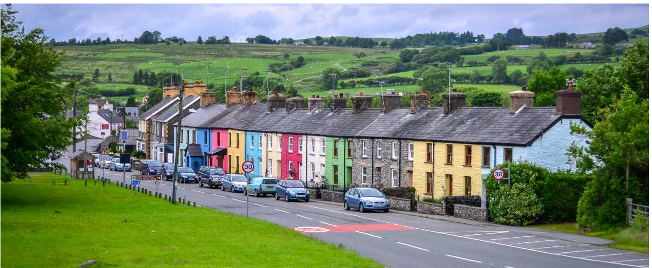
The tradition of painting cottages and terraces in a variety of colours, this example being at Pontrhydfendigaid