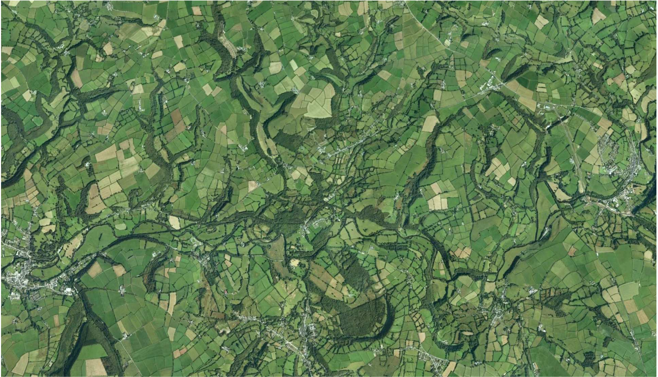
The meandering course of the Teifi running between Llandysul (right) and Newcastle Emlyn (left), highlighted by incised and wooded strips. Note also the huge variation in field size and hedgerow density, with clusters of enclosed, intimate fieldscapes, contrasting areas of open, improved land. Note also a number of small, incised tributary valleys with woodlands on steep sides.