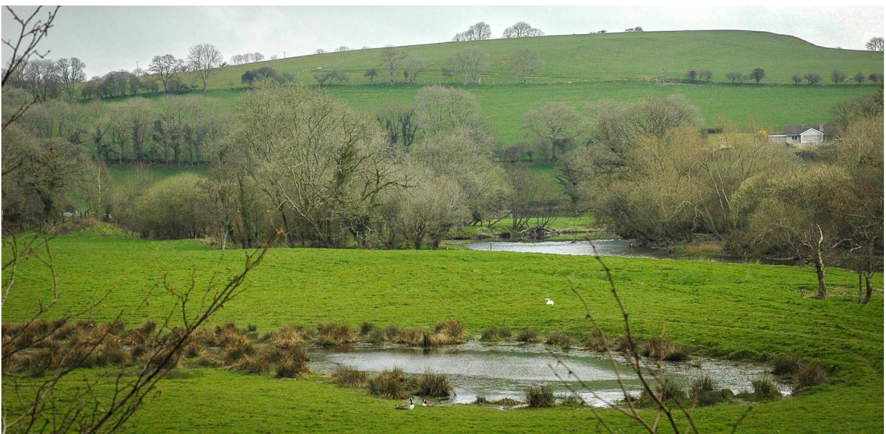
Pastoral valley floor west of Cenarth