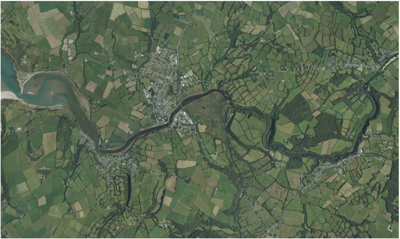
The lower Teifi Valley showing the long, meandering, incised estuary as well as the town of Cardigan.