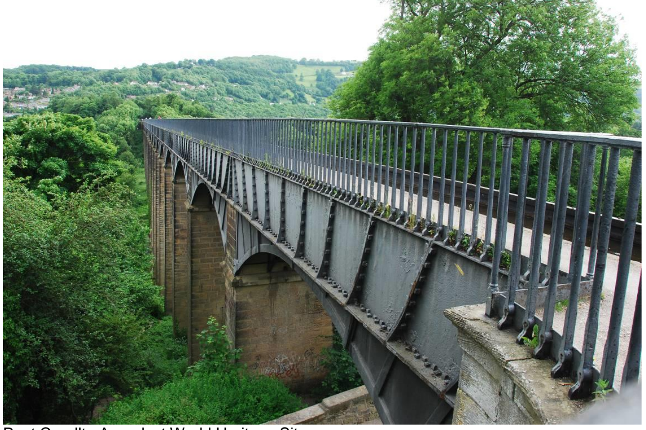
Pont Cysyllte Aquaduct World Heritage Site