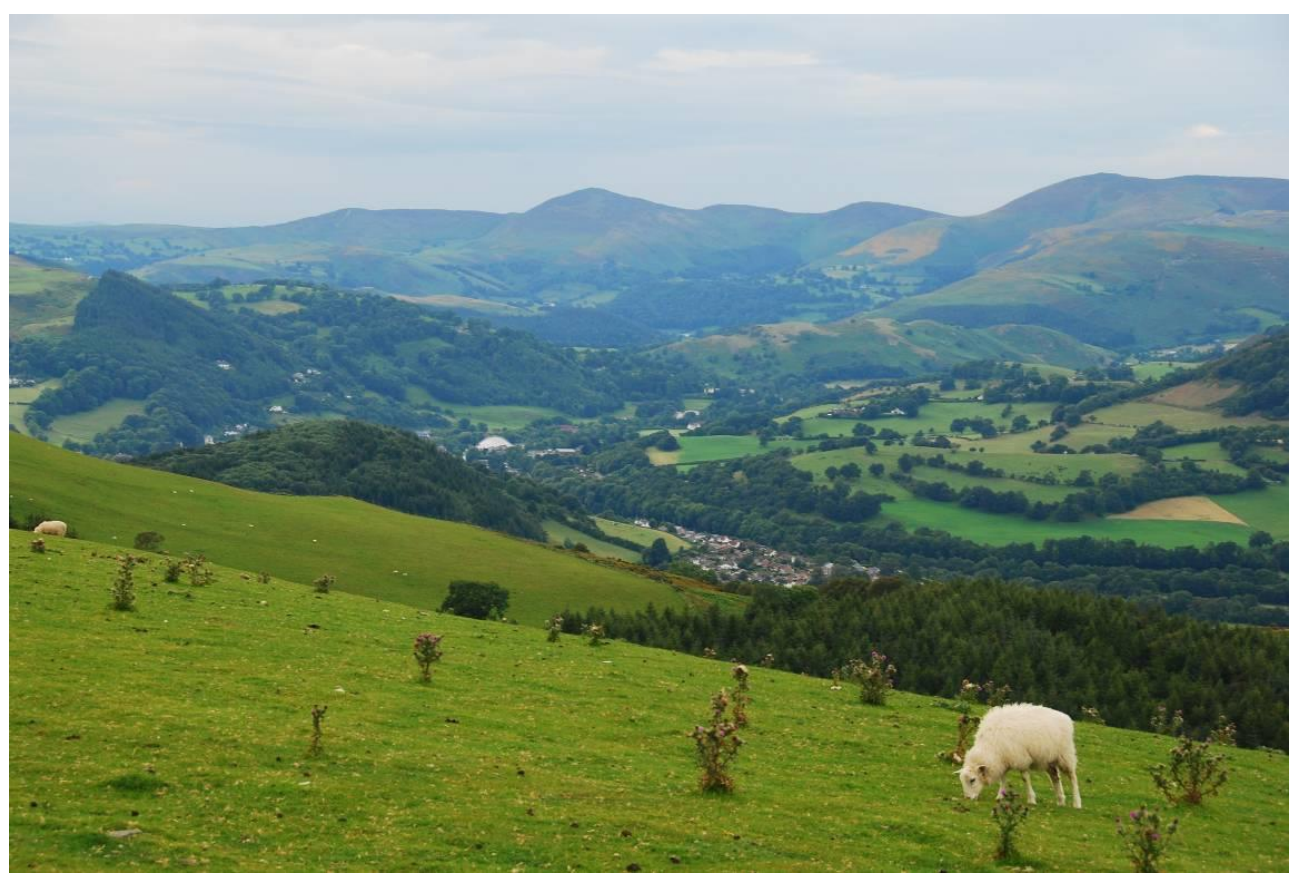
Vale of Llangollen from the south, with the southern part of the Clwydian Range area in the background. The context of this valley becomes more clearly defined as being inland and closely surrounded by uplands, especially in winter