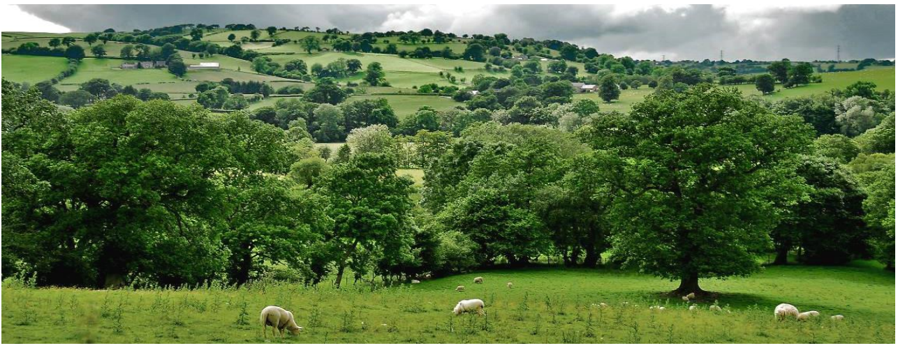
West of Corwen the valley becomes a quieter, gentler landscape of well-managed country, with farming and small villages, as seen here near Cynwyd.

The Vale of Llangollen is characterised by dramatic and quickly-changing scenery. Although the railway, the canal and the historic A5 road all share this corridor, the impression is more of a beautiful landscape than a busy transport route – a perception strengthened by the slow movement of canal boats and the bucolic character of the steam railway. Castell Dinas Brân guards the entrance to the valley, as if it had been constructed as a romantic ruin. Llangollen, an attractive, but constricted town, by contrast, has a sense of bustle and noise, particularly during the summer months, and above all when the International Eisteddfod is in session. The town sits at a naturally scenic location beside the Dee, where the water flows across flat beds of rock and tumbles into deep pools as it flows under the Medieval stone bridge. Even more impressive than all this is what lies just beyond to the north. The entire hillside is comprised of towering limestone cliffs and screes, arranged in a series of sweeping convex curves, running up to a remote, tranquil and scenic side-valley head known as 'World's End'. These limestone exposures, Cregiau Eglwyseg, are by far the most dramatic in North East Wales, and the scenic 'Panorama Drive' at their foot is a popular way to take in these sights.