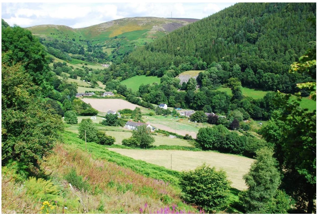
A number of secluded side valleys cut deep into the hills north of Llangollen. This one is overlooked by the Horseshoe Pass, so named after the circuitous route the road takes as it follows the contours around the various side valleys.