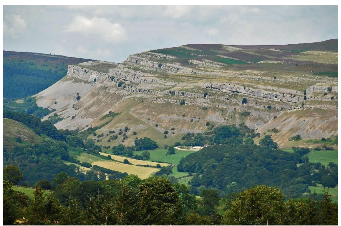
The very distinctive limestone cliffs and scree slopes of Creigiau Eglwyseg mountain, north of Llangollen.