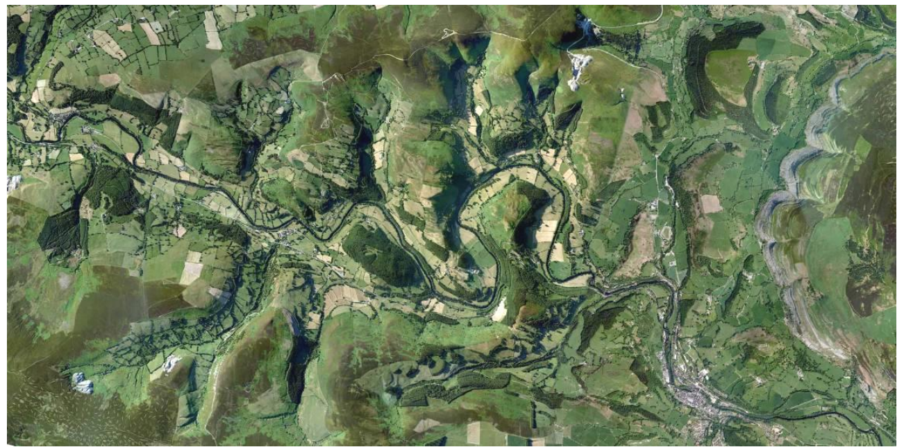
The prominent incised twists and turns of the Dee below Corwen, and the interlocking spurs of hillsides. The dramatic rock exposures of Creigiau Eglwyseg are seen to the right of the image. . © Getmapping 2006