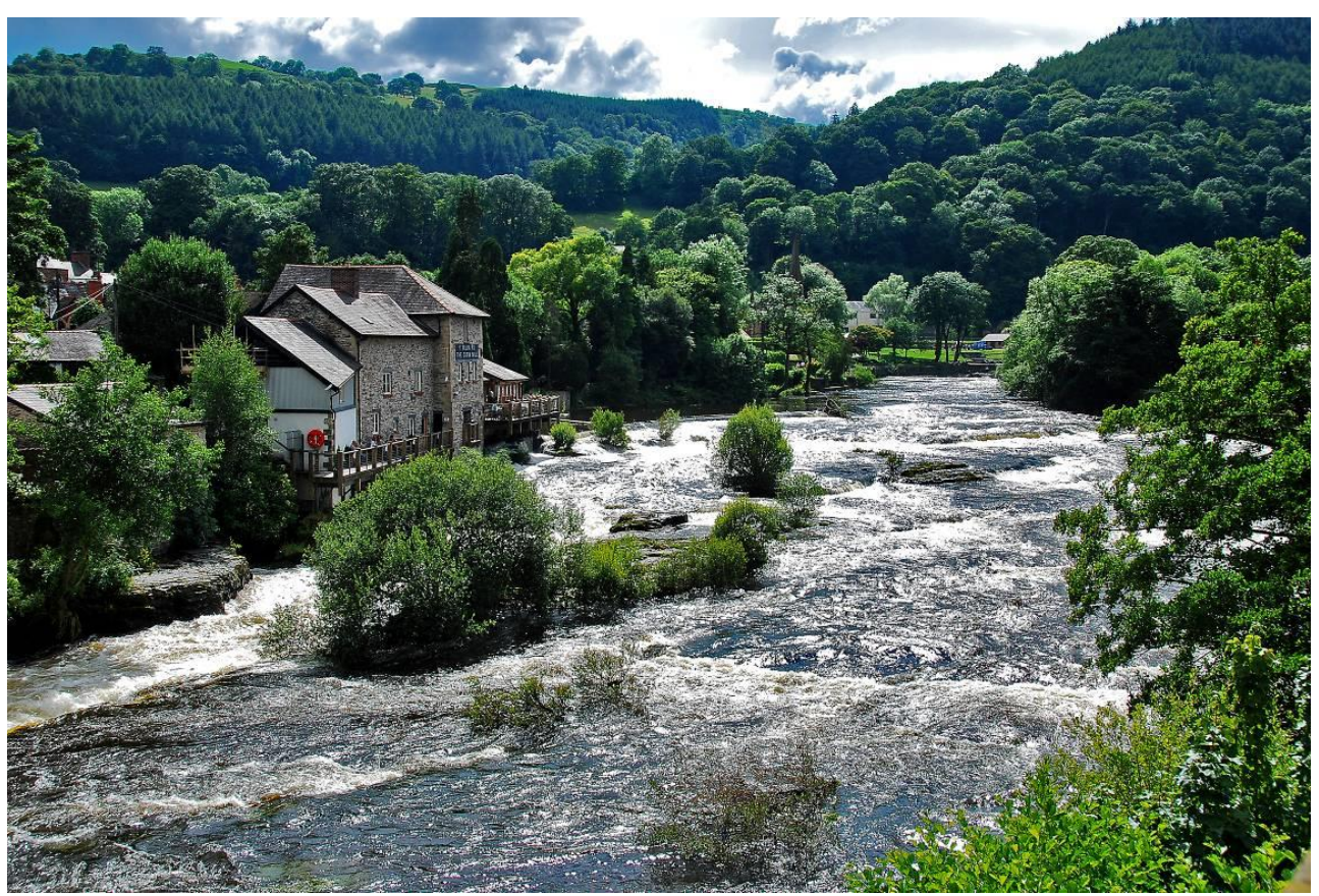
River scenery: the Dee, the largest river in North Wales, cascading through the centre of Llangollen.