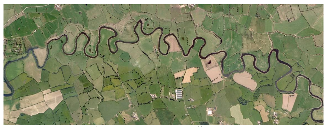
The meandering course of the River Dee near Isycoed/Caldecott

hedgerow trees. A particularly distinctive feature is the remnant Medieval ridge and furrow open field system, which underlies the more recent landscape. These ridge and furrow corrugations are most apparent at dusk and dawn, when the sun is low, or after light dustings of snow.