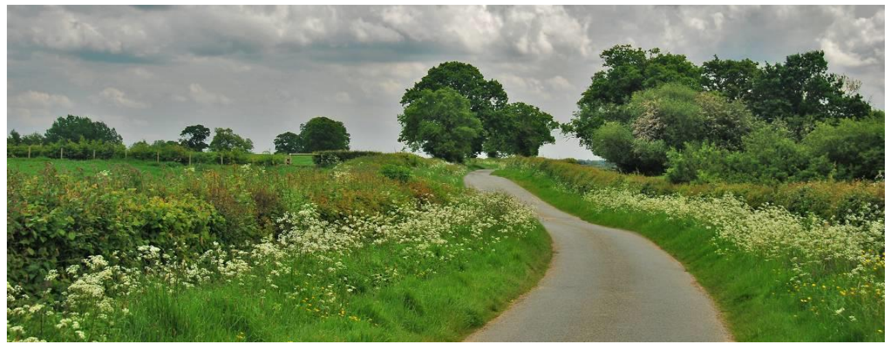
A typical undulating rural scene in the west of the area, this one being near Overton.